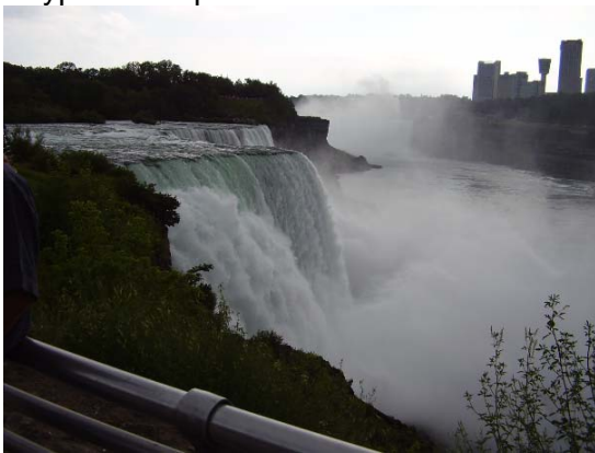
The Falls of Niagara Day and