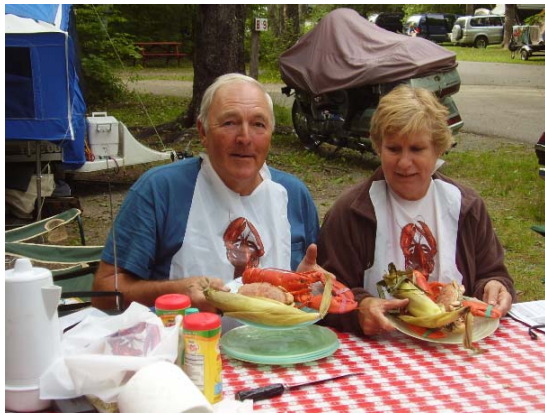
Eating Lobster and Crab in Bar Harbor