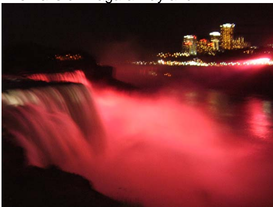
The Falls of Niagara night