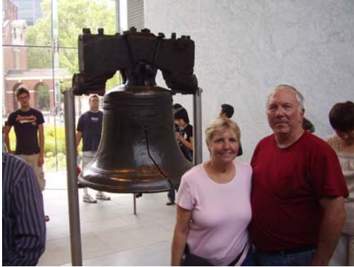
The Liberty bell