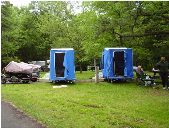
A typical camp site

going 70 on the interstate. Didn't really notice it until Leo told me over the CB. 30 minute delay to change tire. 1 hour delay to purchase new tire(s) at Wally World and Tractor Supply. All in all a great trip about 4600 miles in 29 days. Here are just a few off the several hundred picture we took.