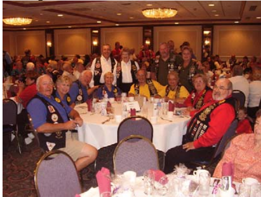
Judges at the NE rally